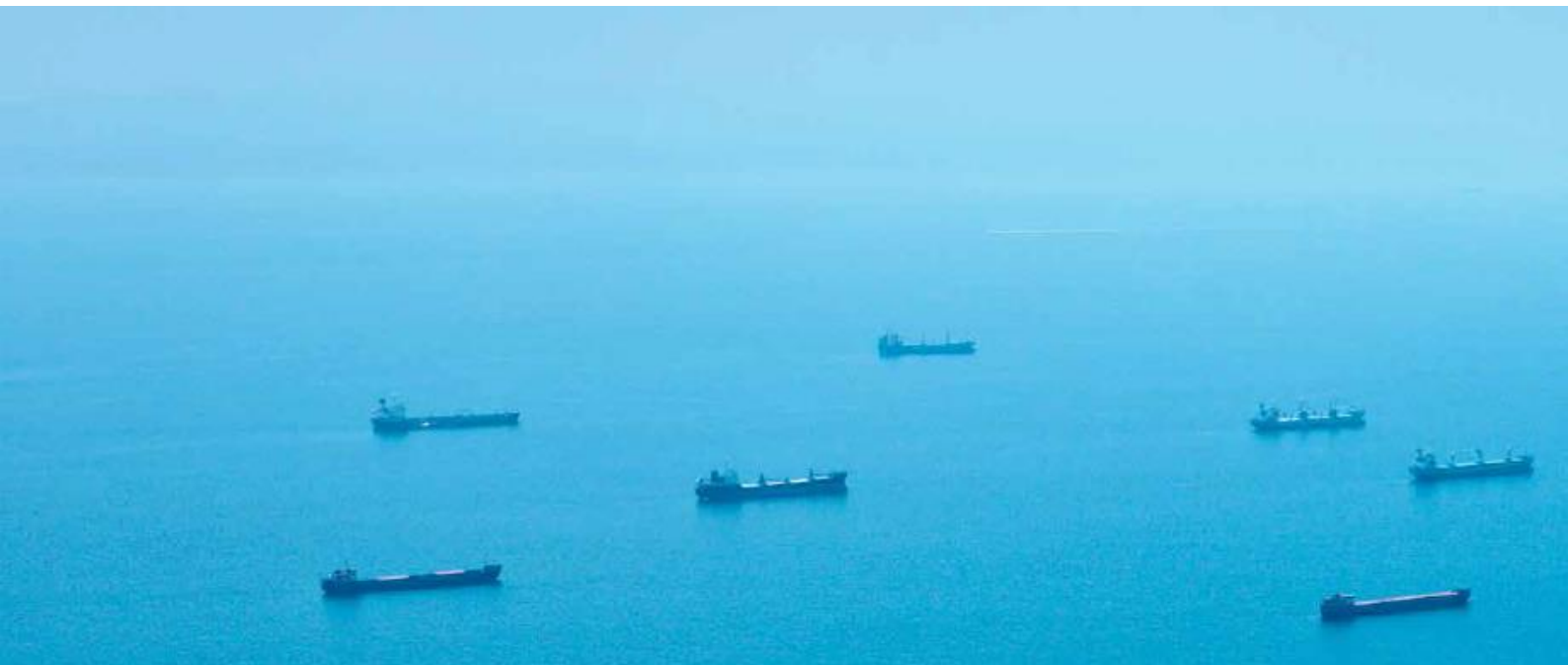
CHART TRACK NAVIGATOR3

Since 1999, Chart Track has been successfully assisting Mariners to sail safely and efficiently.